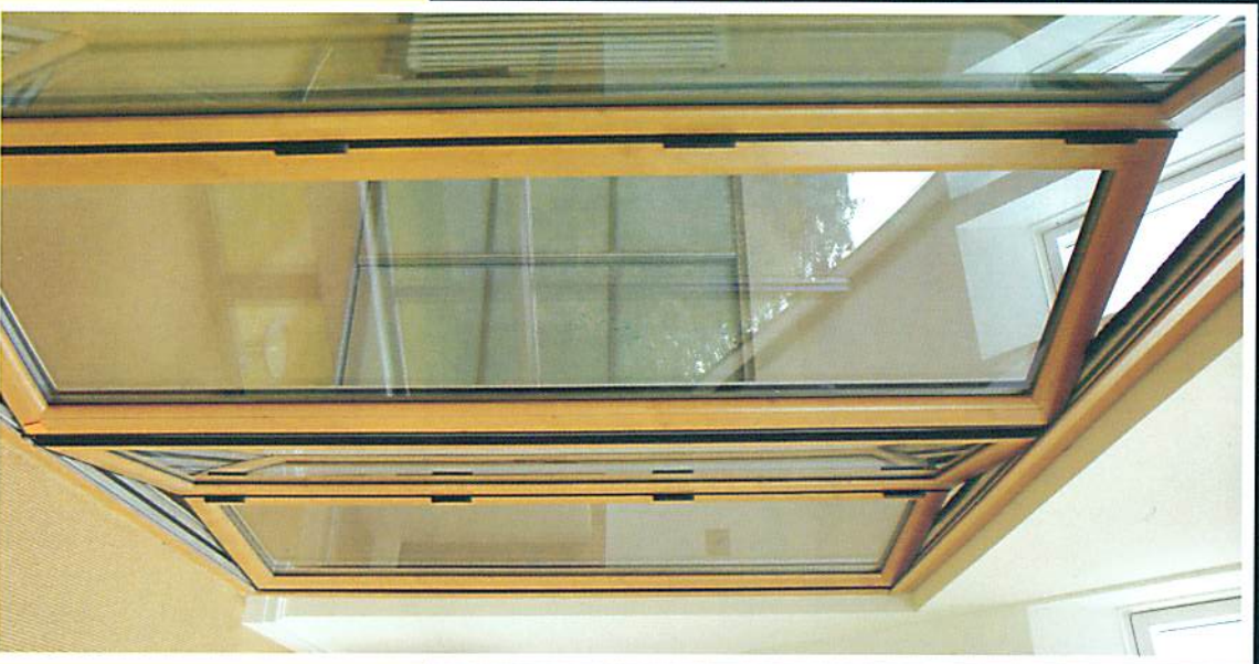
Full range of woodgrain colours in stock

Fir Cream Chartwell White Irish Oak Grey Black Green Green Antique Pine (Ebony)